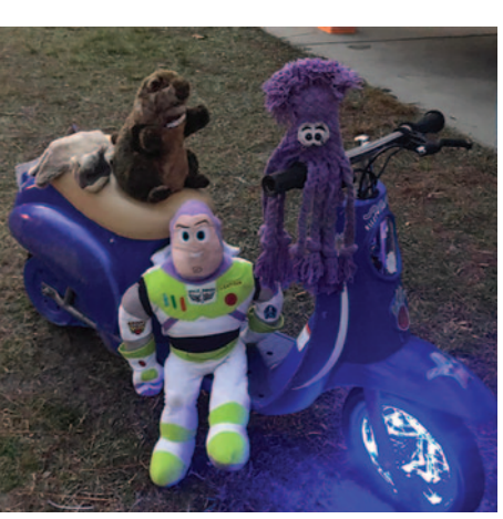
Lynn took Guinevere camping and she ended up on a scooter with Buzz and pals.

Dawn H and Gracie headed out to enjoy one of those warm Nov. days.